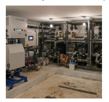
Space, lighting and clear equipment plumbing layout increase comfort, ease of service, while reducing maintenance errors and increasing energy and ergonomic efficiency.

pump curves, filter size and the flow requirement for the heater. We also try to eliminate dead spots in the pool by distributing return fittings so that the entire pool is treated chemically.