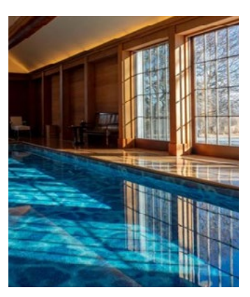
Superior water and air quality go hand-in-hand with ease of service and maintenance and are largely driven by decisions made in the engineering and installation process.

measures that work to enhance the function of all the others.