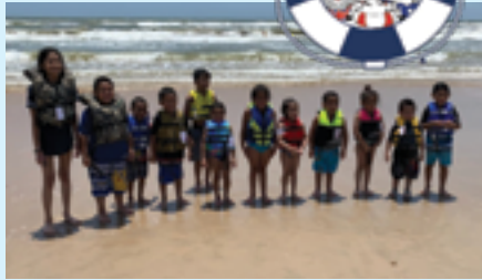
The Judah Brown organization held a life jacket giveaway in the Galveston area last summer, where they helped give over 450 life jackets to children and families on the beach.