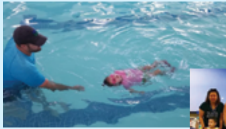
A recipient of a Judah Brown swimming instruction scholarship learns to swim, float, swim.

- Judah Brown held a preschool training event in early 2020 on drowning prevention.