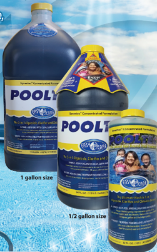
1 gallon size